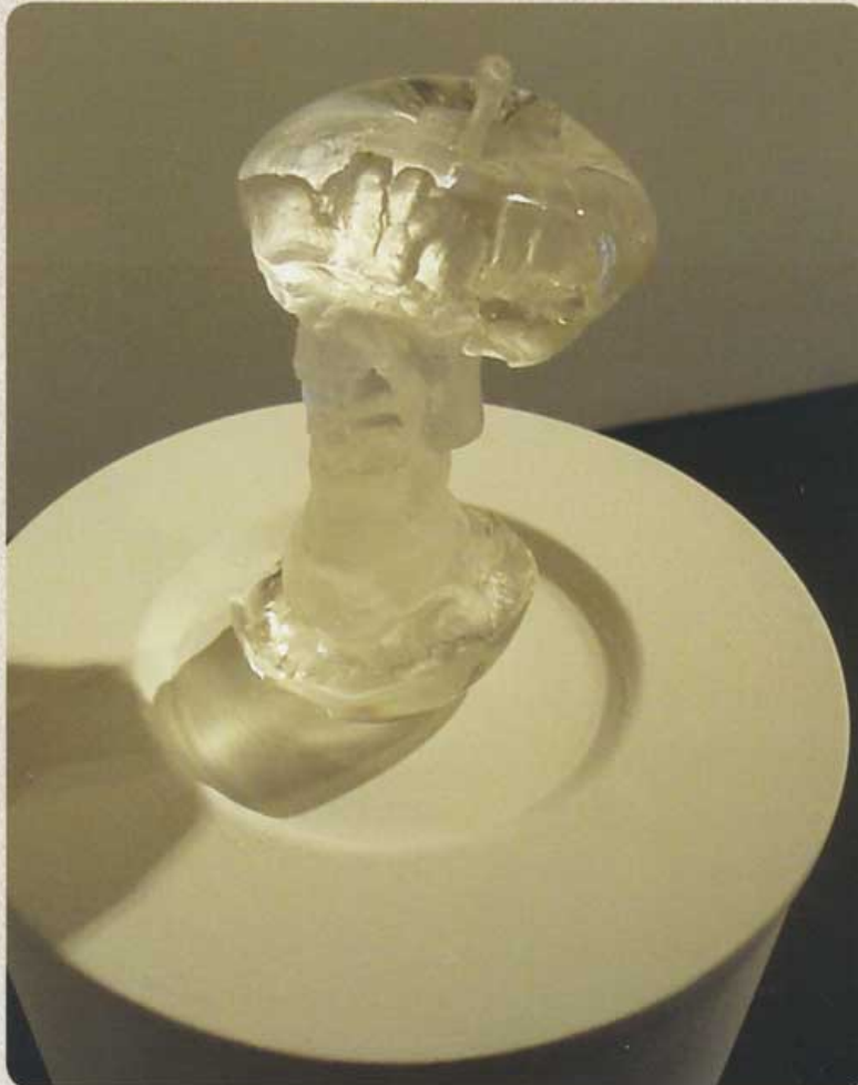
Joanna Manousis FLESH 3

My work often incorporates narratives associated with domesticity, the human figure and the residue left behind in our day-to-day activities. In "Flesh" (1 + 2) notions of fertility, the consumption of the female form and the continuous cycle of life are all conjured in the depiction of apple to seed.