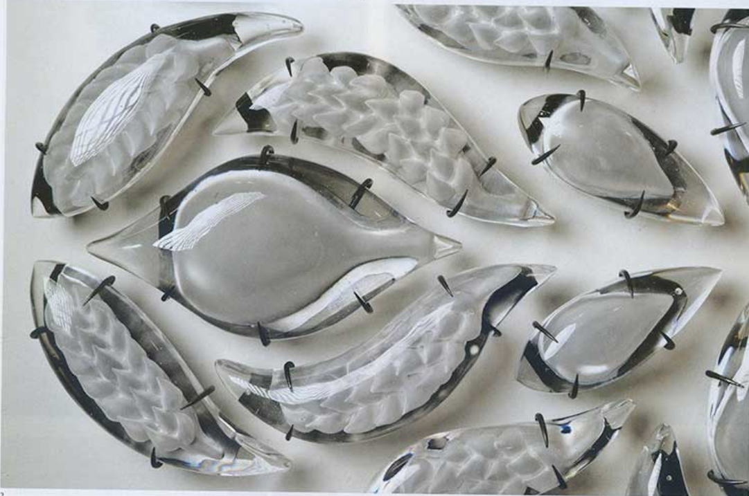
3 Distilled Portrait I , crystal, mirror, stainless steel, taxidermy magpie, 15 x 6 x 6"

Sparkling and brilliant, Joanna Manousis' The Dominant Sophia is the kind of work that beckons from across the room. Inset into the wall like gemstones into a brooch, its 25 crystal components draw viewers in with their shimmering, gold-filled complexity. Immediately alluring, the piece is also perplexing, asking viewers to construct meaning out of seemingly disparate components. Are those braided sheaves of wheat within the glass? How do they relate to the form, whose radial configuration quotes so directly from stained glass church windows? These questions—questions of authenticity and identification, filtered through reflection and reflectivity—are at the heart of Manousis' artwork.